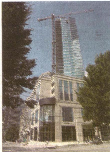
1010 Midtown is the first phase of the 12th & Midtown project, which aims to transform that section of the city into a bustling urban area called the "Midtown Mile."