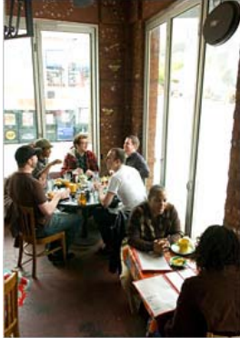
At the Flying Biscuit restaurant, breakfast is served all day. More Photos »

Winter Day Out in Washington, D.C. (January 18, 2008)