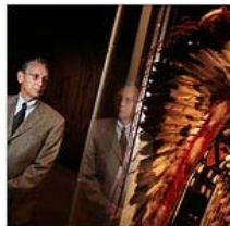
Undaunted Director at Indian Museum