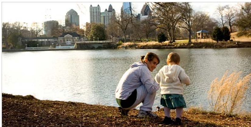
Piedmont Park offers unparalleled views of the Midtown skyline.