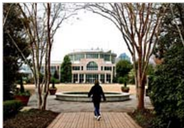
The Atlanta Botanical Garden's Fuqua Conservatory remains tropical in the winter for the benefit of orchids, pitcher plants and visitors alike. More Photos >

We've earned a brunch at the Flying Biscuit Café, where breakfast is served all day. Picture windows expose the bustling corner of Piedmont and 10th, site of Outwrite, as well Nickiemoto's sushi bar and Zocalo Mexican Restaurant (where even a second margarita may be ill-advised). The cafe's eponymous biscuits, served with cranberry apple butter, provide reason enough for the visit, but the menu also features an array of flavorful stuffed omelets and scrambles.