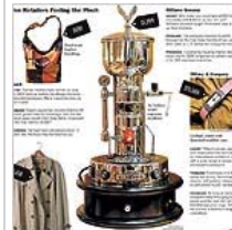
Thinking Twice About That $400 Handbag