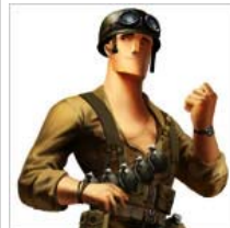
The Game May Be Free, but Winning Costs Money